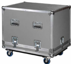
CASE-TS4XTIC transport case