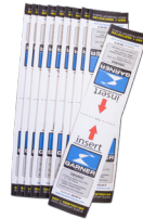
SSD-MT media transport sleeves