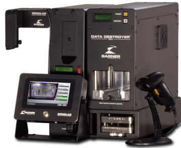
IRONCLAD Erasure Verification System