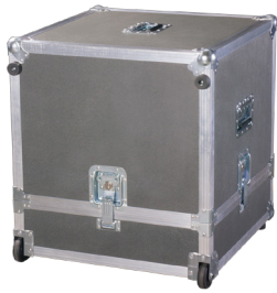
CASE-25SSD Transport Case