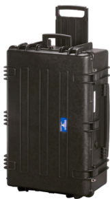
CASE-PD5SSDIC Transport and shipping case