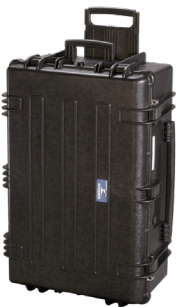
CASE-ICH3D3 MIL SPEC shipping case