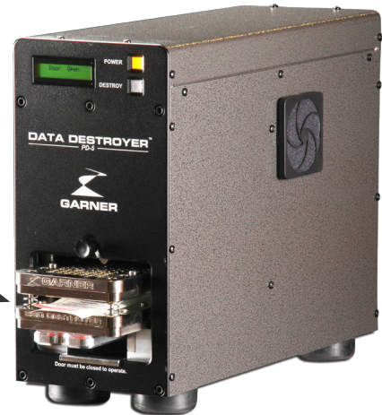
PD-5 with SSD-1 in the destruction chamber