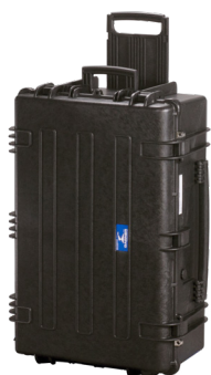
CASE-HD2XIC MIL SPEC Shipping Case