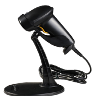
SCAN-1X Media destruction software and scanner