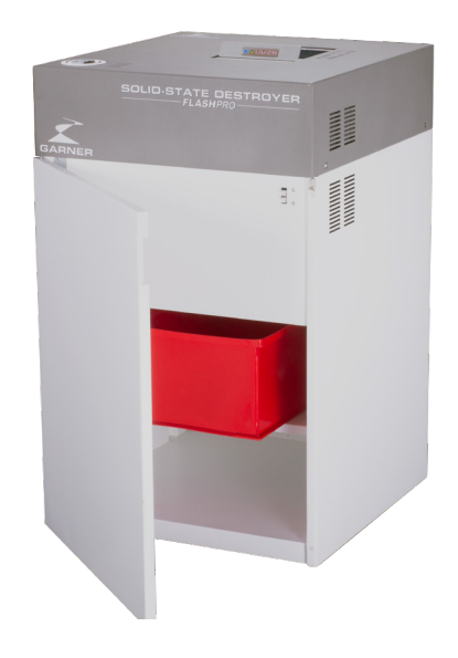
Comes equipped with catch basket and disposable liner.