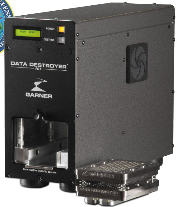
*Shown with optional SSD-1 solid-state destroyer