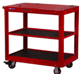
Data Eliminator Cart