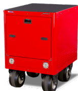
Enclosed Destruction Cart