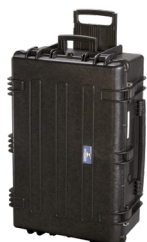
CASE-PD5SSDIC MIL SPEC Shipping Case